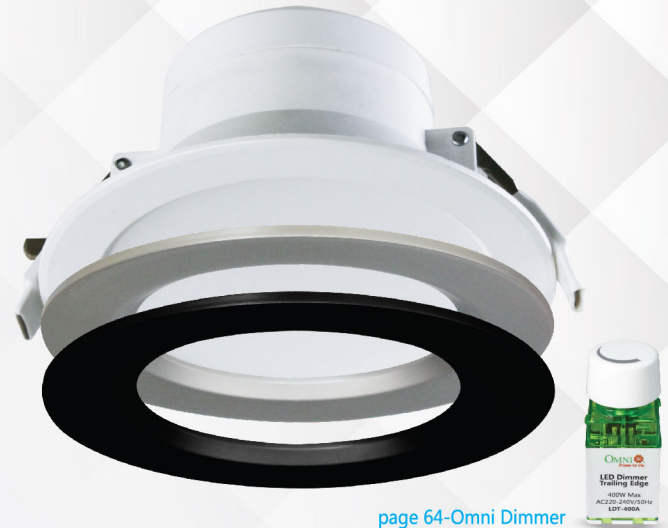
page 64-Omni Dimmer